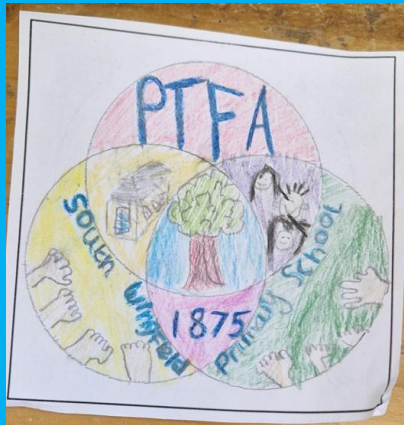
New PTA Logo

We are delighted to share that the pupils voted for a new PTA logo, and the winning choice was this beautiful design.